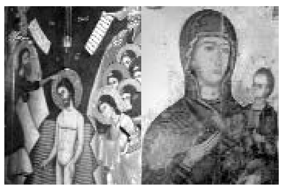
Double-sided icon of Theophany and the Theotokos, Kaftun, Northern Mt. Lebanon.

3rd – In Arabic: on the open scroll that the Prophet David holds, we read a composite text taken from the Psalms 114 [113A]: 3-5 and 77 [76]: 17 [16].